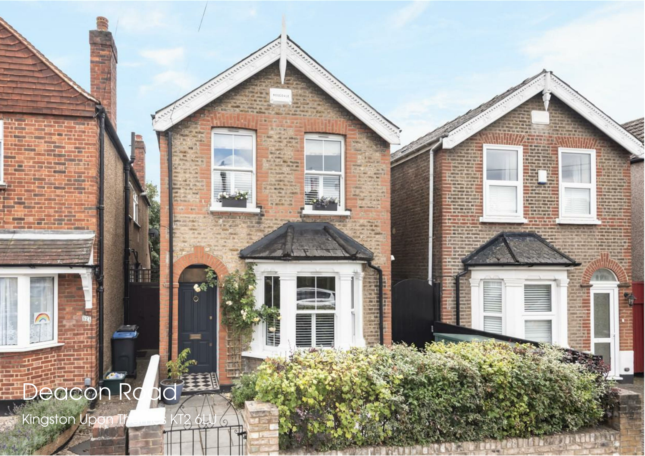
Deacon Road Kingston Upon Thames KT2 6LU